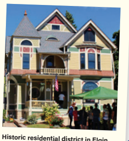
Historic residential district in Elgi