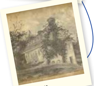
Old Rock House